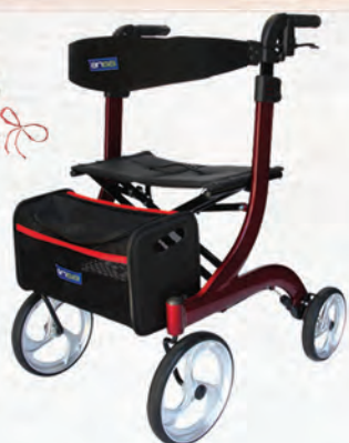
Nitro Seat Walker Lightweight, folding, mobility assistance