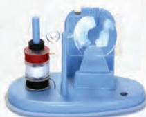
Needle Threader Ideal for people with poor eyesight