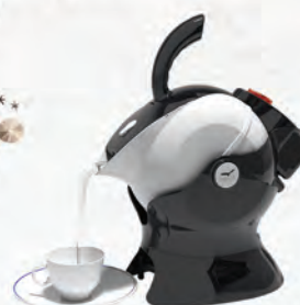
Uccello Kettle Safe and effortless pouring technology